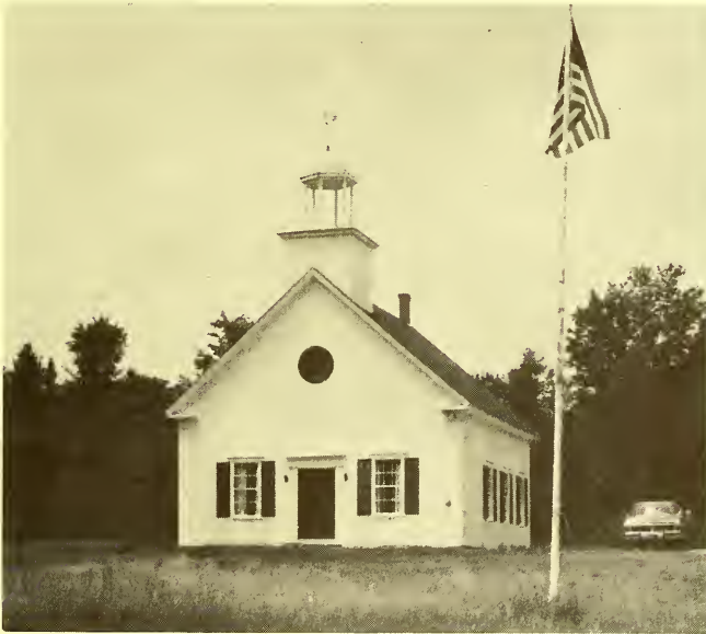
Dorchester Community Church Entered in National Register of Historic Places November 25, 1980